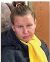
Going from fear to faith . . . Pg. 3