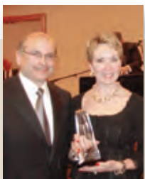
Spring Fling Star Ball 2016 Pg. 4