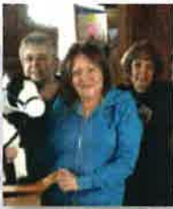
People You Should Know Pg. 4