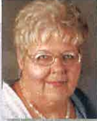
An Encouraging Word from Marilyn . . . Pg. 2