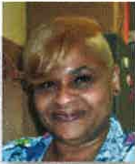
I No Longer Walk that Dark, Lonely Road . . . Pg. 3