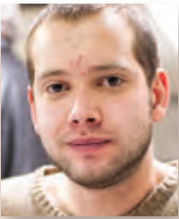
The tens of thousands of dollars spent for my rehab were not effective ... Pg. 3