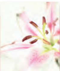
In Memoriam Pg. 4