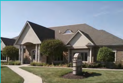
MorningStar Counseling Center