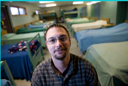
Men's Emergency Shelter