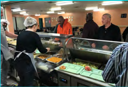
East Side Café

Mission Statement. MorningStar Mission Ministries is a non-denominational organization dedicated to relieving the spiritual and physical hunger of the poor. We do this by providing food for the hungry, clothing for the needy, shelter for the homeless and the Gospel of Jesus Christ for all.